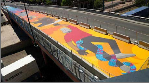
El Paso Chihuahuas - Pedestrian Bridge coating