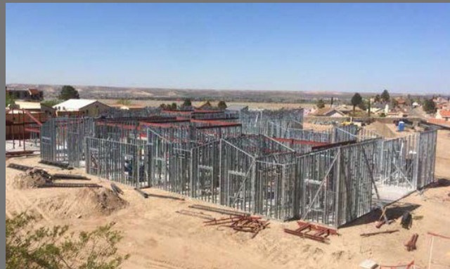
Good Samaritan Assisted Living Center El Paso, TX