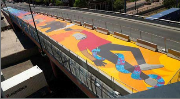
El Paso Chihuahuas - Pedestrian Bridge coating