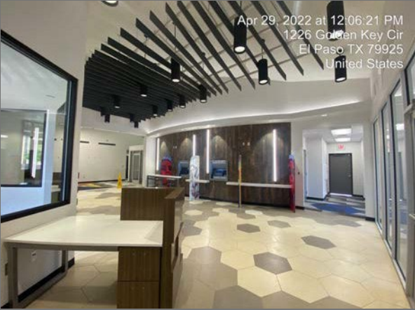
TI - Interior Renovation TFCU Golden Key Branch El Paso, TX