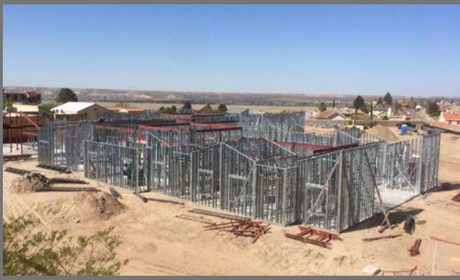
Good Samaritan Assisted Living Center El Paso, TX