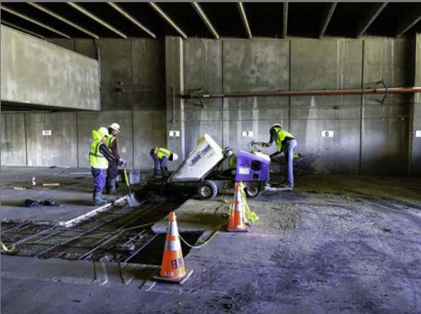
GSA - Replacement of Domestic Water & Sanitary Waste Lines at RC White Building - El Paso, TX