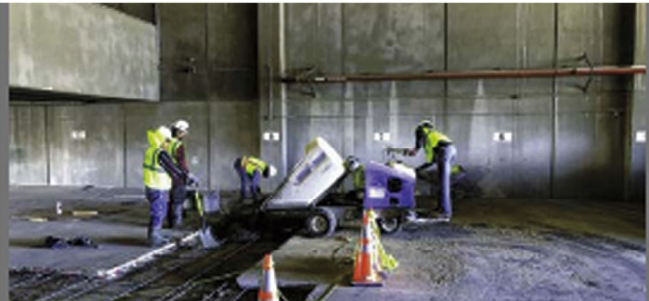
GSA - Design/Build Replacement of Domestic Water & Sanitary Waste Lines at RC White Building - El Paso, TX

BONDING CAPACITY $3 MILLION SINGLE $5 MILLION AGGREGATE 236220 COMMERCIAL CONSTRUCTION