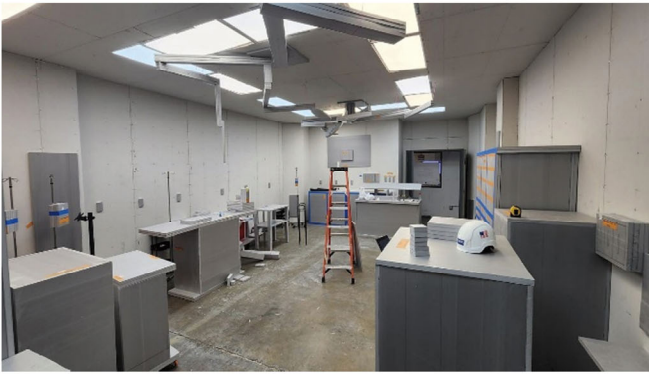
USACE - VA El Paso New Healthcare Facility Mockups for Clark Construction