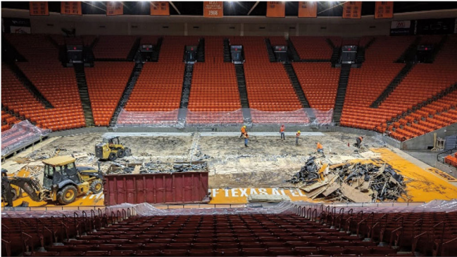
University of Texas at El Paso - Don Haskins Special Events Center Subsurface Improvements