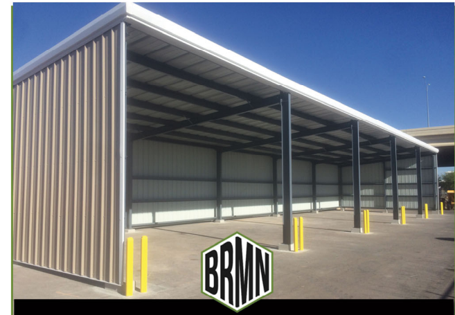
VA - DESIGN/BUILD EQUIPMENT SHELTER AT FORT BLISS NATIONAL CEMETERY